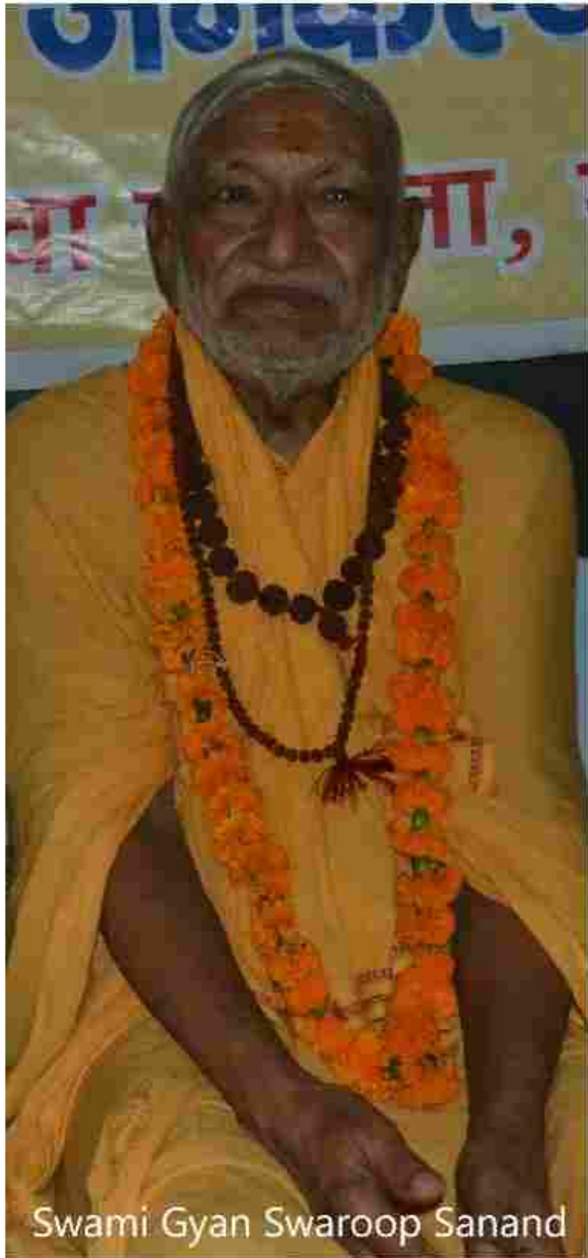
Swami Gyan Swaroop Sanand